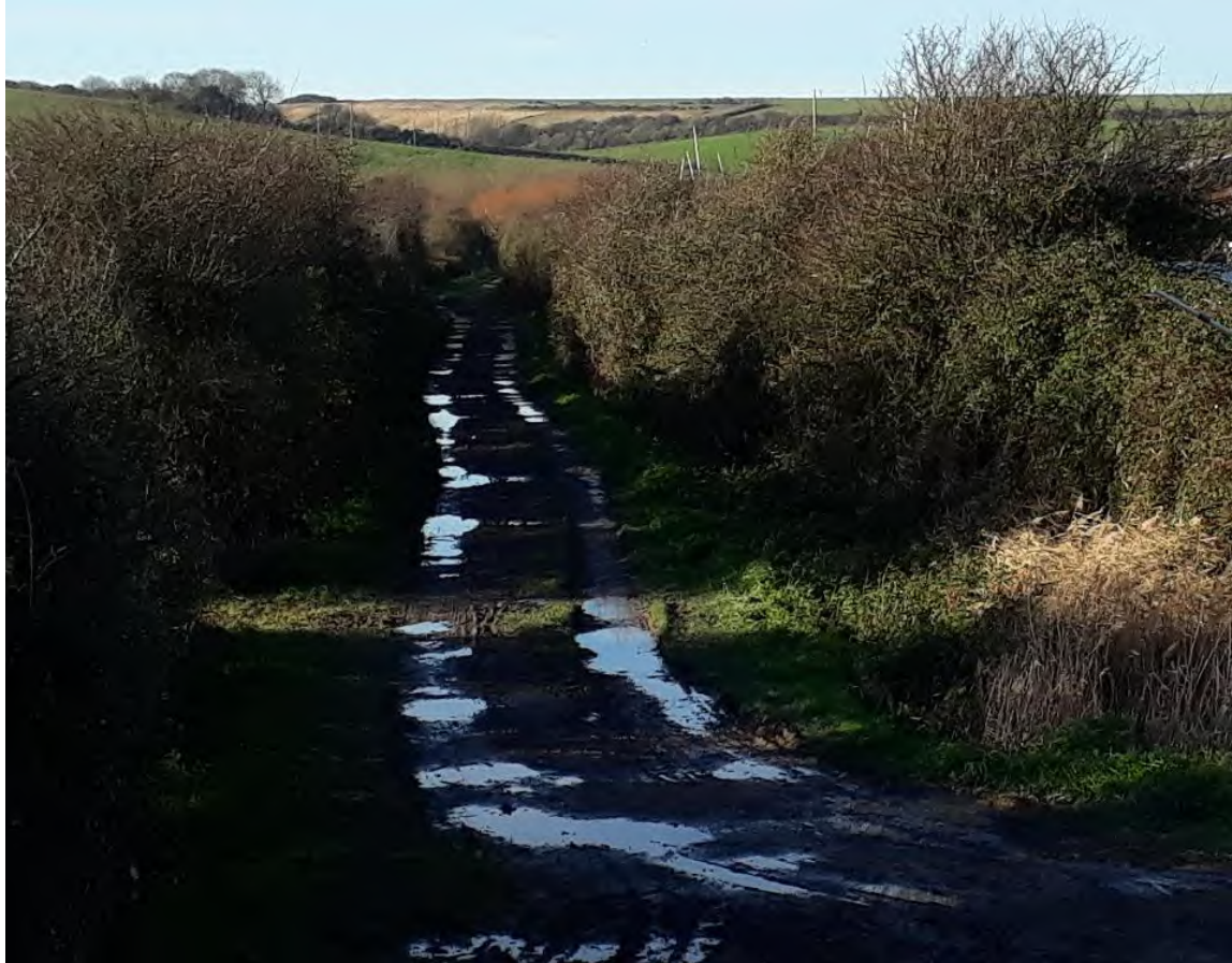
Newhaven and Seaford Sailing Club (NSSC) access track (approx Chainage 920-650) looking west