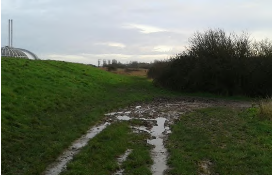
Riverside section below river flood defence and turning onto NSSC access track (approx Chainage 940) looking north (top) looking south (bottom)