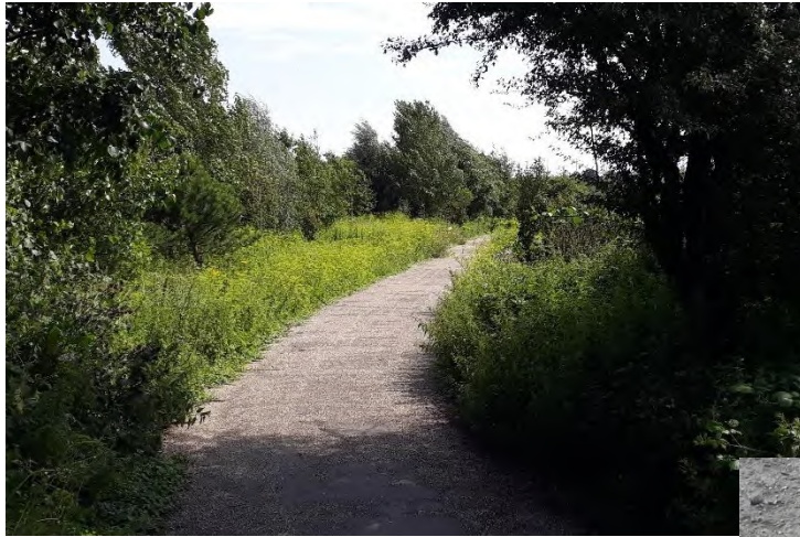
Riverside Park (approx Chainage 1640) looking south (top) and north (below)