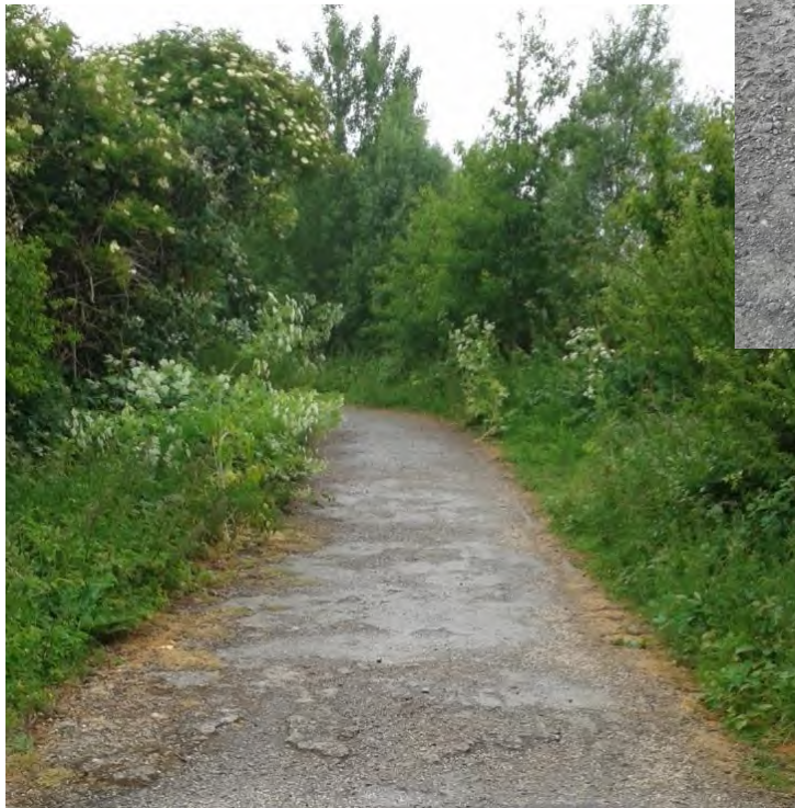
Previous old, degraded / uneven and broken sealed surface 2.5m wide