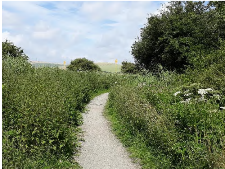
Riverside Park (approx Chainage 1550) looking north Previous degraded gravel surface 1.5m width, narrowing to <0.8m