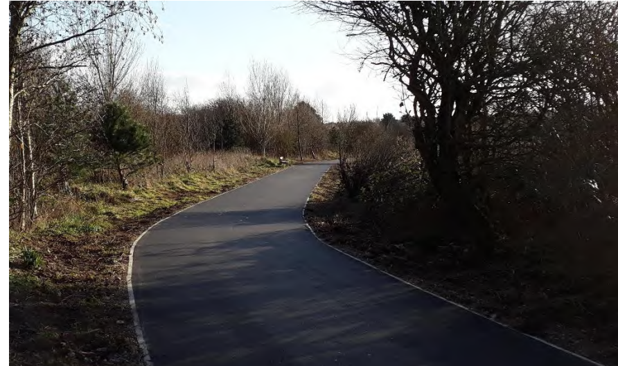
Opened February 2022 Re-profiled, widened to 3m, sealed surface and concrete edging.