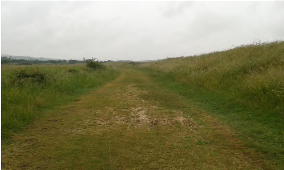
Riverside section below river flood defence (approx Chainage 1350 top and 1250 bottom) looking north, no path and signs of seepage

Opened January 2023 Riverside section - New path constructed 2.5m width, unbound gravel, limestone dust capped surface