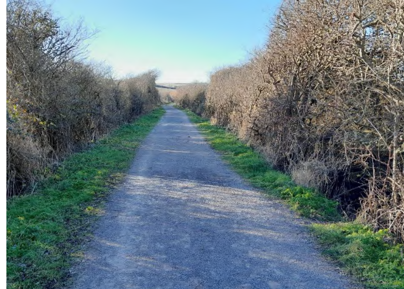
Opened January 2023 NSSC access track - New path constructed 3m width, unbound gravel, limestone dust capped surface