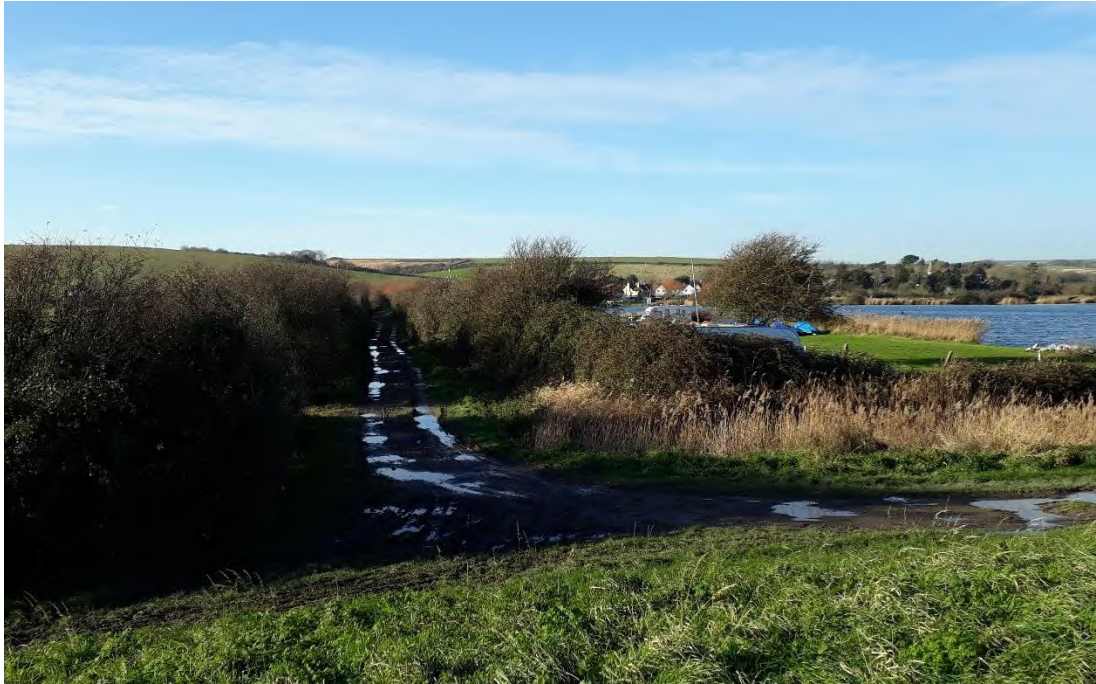
Newhaven and Seaford Sailing Club (NSSC) access track (approx Chainage 940) looking west