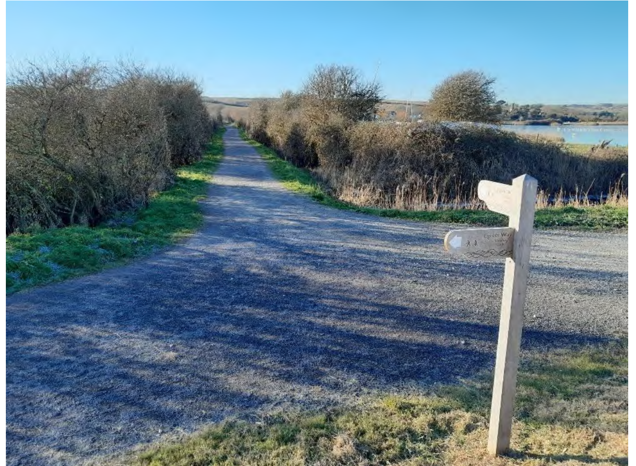
Opened January 2023 NSSC access track - New path constructed 3m width, unbound gravel, limestone dust capped surface