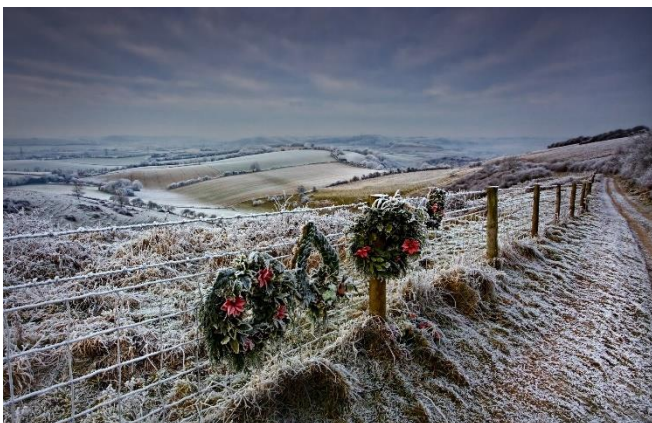
Frosty Butser Hill

There are 15 National Parks in the UK and the South Downs is the youngest, having been created in 2010.