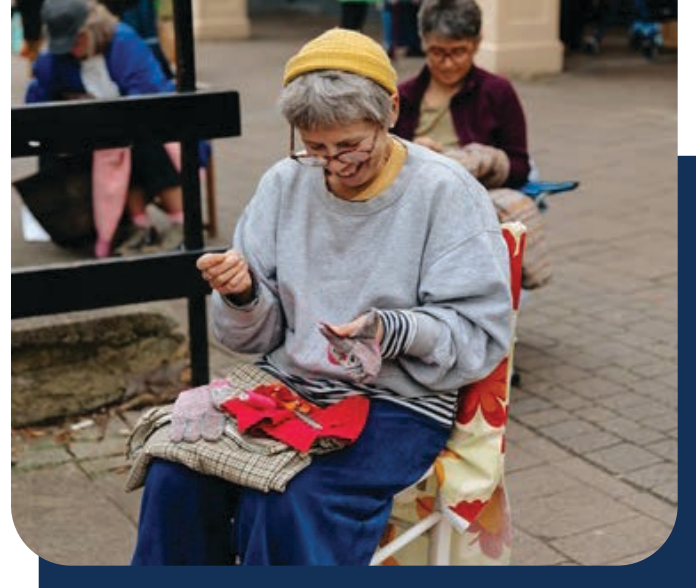
Figure 8 - Stitching during Sustainable Fashion Week

There are currently (November 2023) four groups in residence with Future Shed: Frome Food Network, Everyone Needs Pockets (ENP) Textile Reuse Network, Frome Families for the Future (FFFF) and the Frome Seed Library.