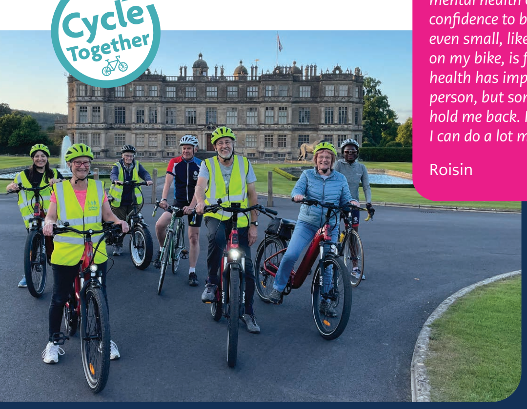
Figure 9 - Cycle Together

"I hadn't been on a bike for so long and even though you remember the muscle memory, it is just knowing your place on the road. As someone living with various mental health conditions, just having the confidence to be able to do something even small, like going out to the shop on my bike, is fantastic. My mental health has improved and I'm not an unfit person, but sometimes my asthma can hold me back. It just reminded me that I can do a lot more than I think I can."