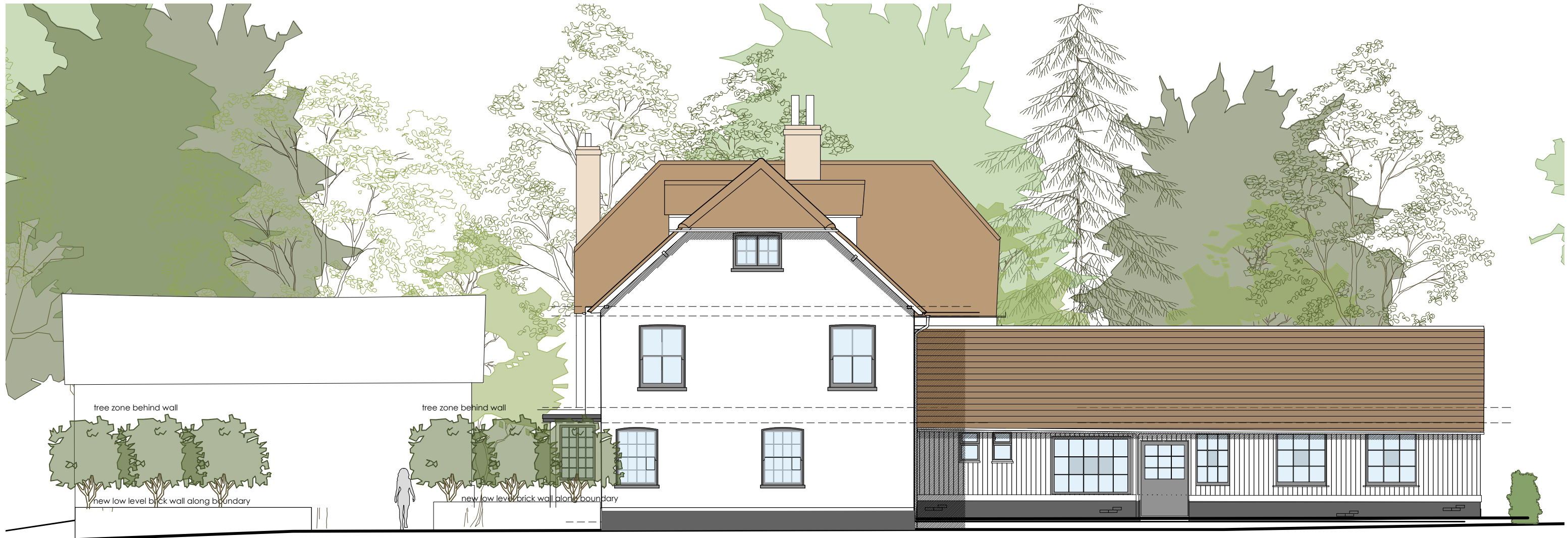
02 South West Elevation

This drawing is copyright and is not to be reproduced. The contractor will be held responsible for the accuracy of works involving the setting out and checking of all dimensions on the drawing and on site. Dimensions must not be scaled from this drawing.