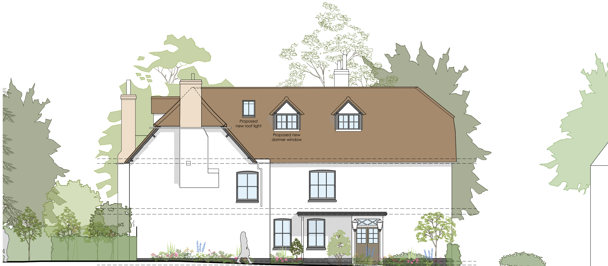
01 North West Elevation

This drawing is copyright and is not to be reproduced. The contractor will be held responsible for the accuracy of works involving the setting out and checking of all dimensions on the drawing and on site. Dimensions must not be scaled from this drawing.