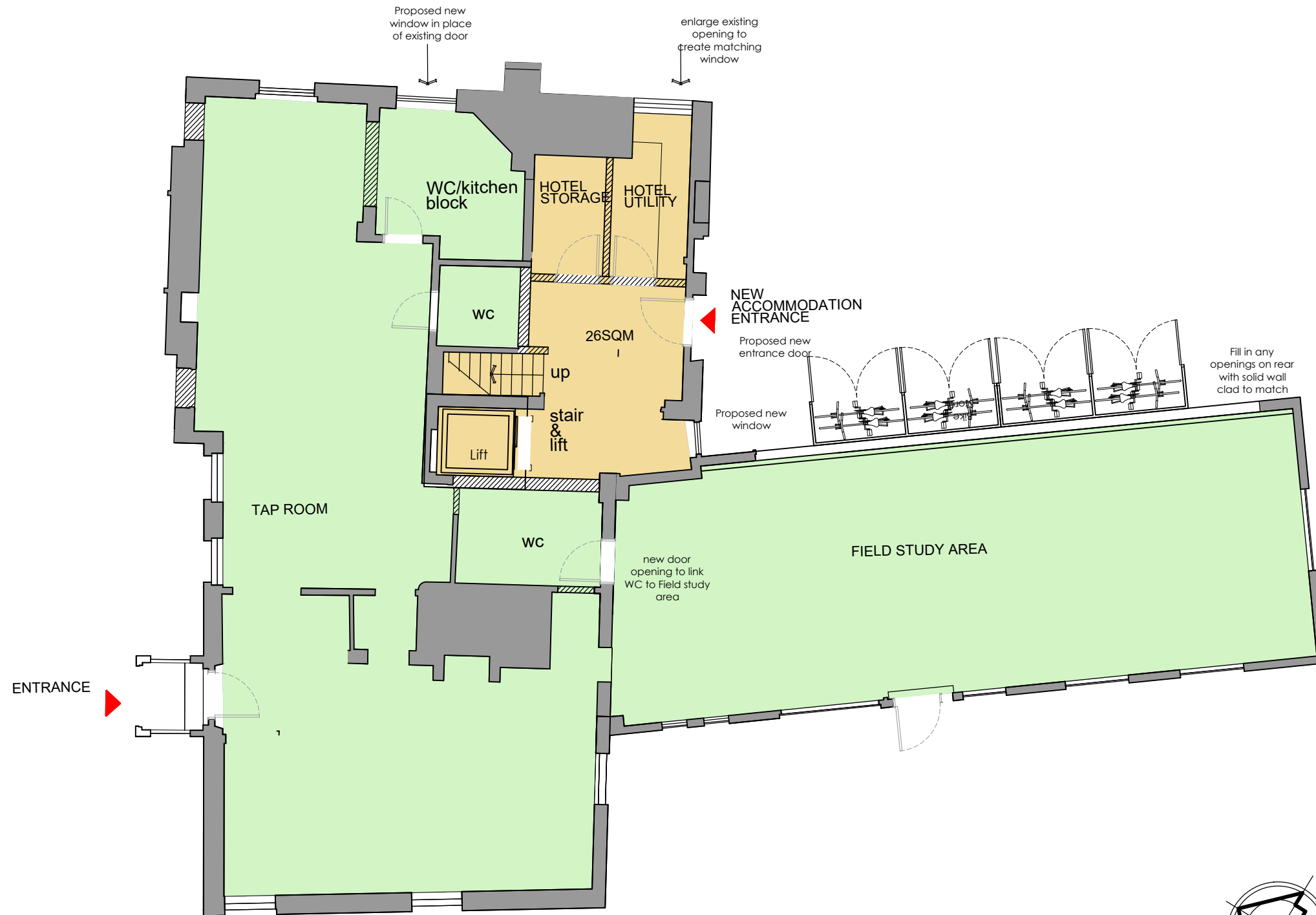
Proposed Queens building Ground floor plan @ 1:100

This drawing is copyright and is not to be reproduced. The contractor will be held responsible for the accuracy of works involving the setting out and checking of all dimensions on the drawing and on site. Dimensions must not be scaled from this drawing.