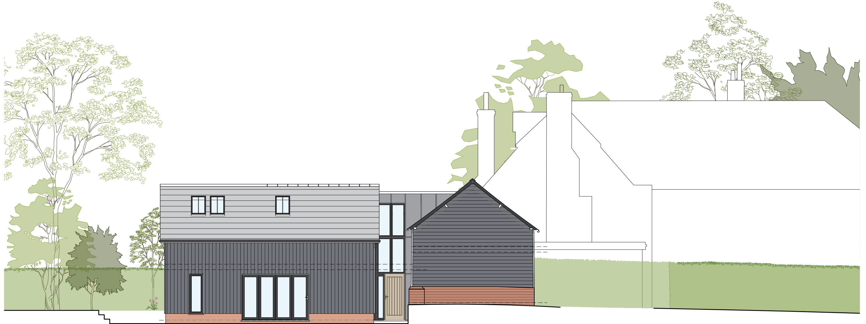
04 North West Elevation

This drawing is copyright and is not to be reproduced. The contractor will be held responsible for the accuracy of works involving the setting out and checking of all dimensions on the drawing and on site. Dimensions must not be scaled from this drawing.