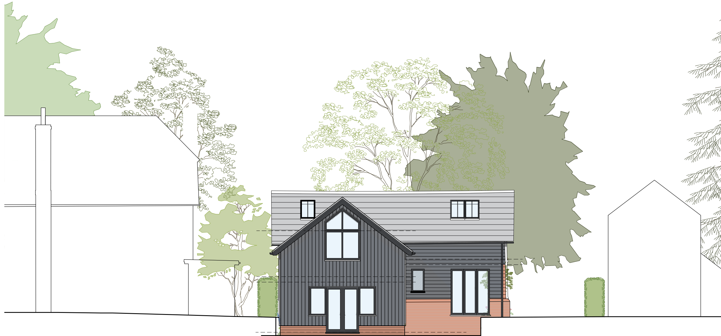
03 North East Elevation

This drawing is copyright and is not to be reproduced. The contractor will be held responsible for the accuracy of works involving the setting out and checking of all dimensions on the drawing and on site. Dimensions must not be scaled from this drawing.