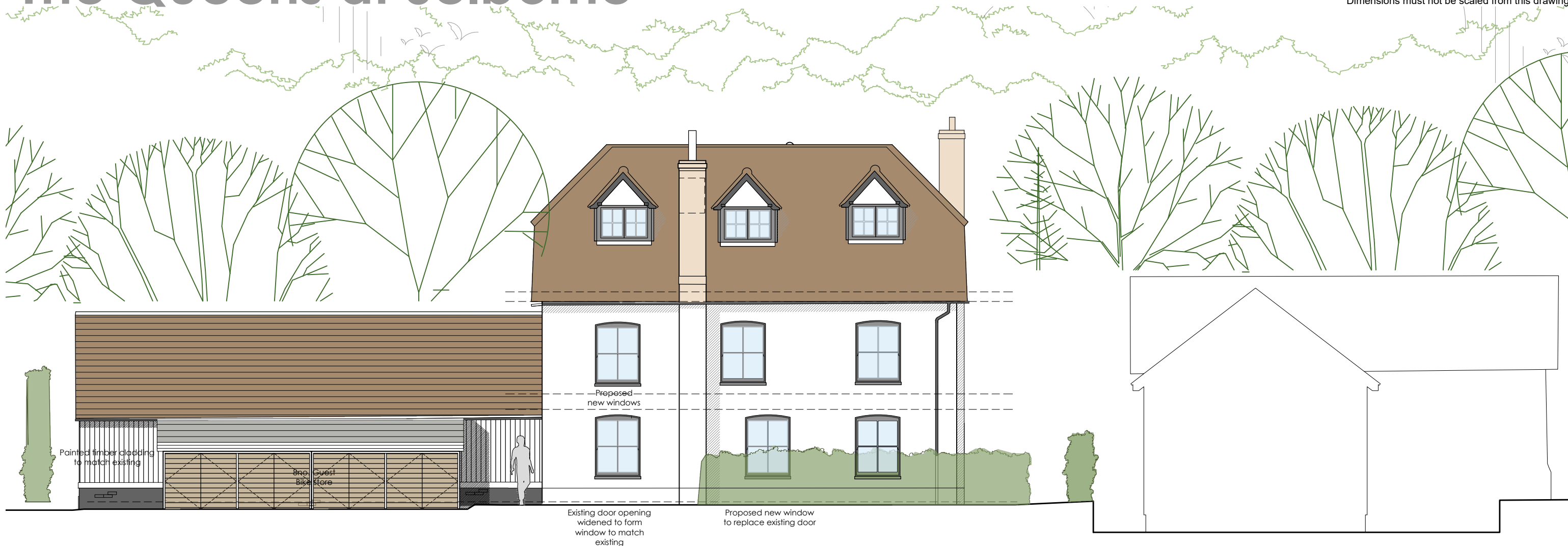
04 North East Elevation

This drawing is copyright and is not to be reproduced. The contractor will be held responsible for the accuracy of works involving the setting out and checking of all dimensions on the drawing and on site. Dimensions must not be scaled from this drawing.