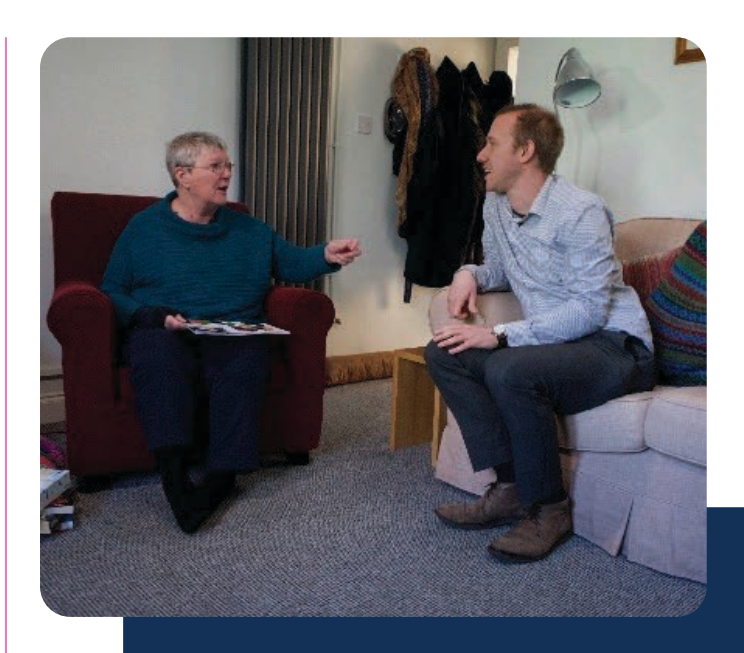
Figure 4 - Future Fit Homes, plan being delivered and explained to the client