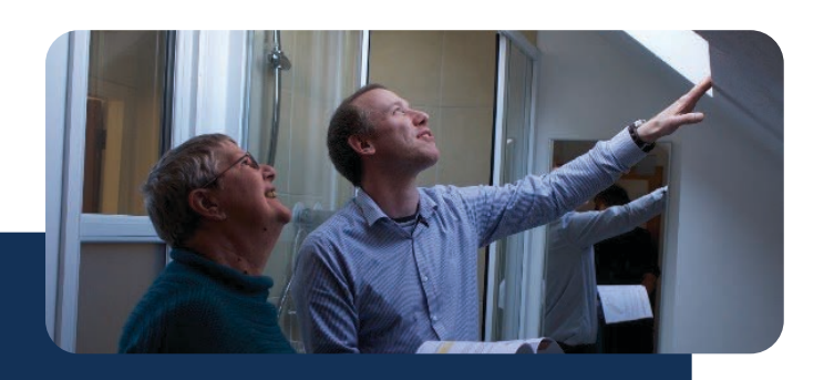
Figure 3 - Future Fit Homes, home assessment plan being delivered and explained to the client