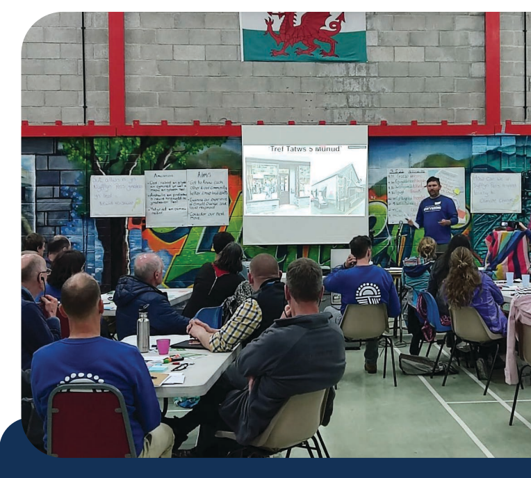
Figure 2 - GwyrddNi, Cyflwyniad Assembly

Once people had registered interest, the team made sure that there was representation from all facets of the community at the assemblies. This did not mean matching percentages of the population, since ethnic diversity in this area is low, and this would have resulted in less than one person on the assembly. As you cannot have part of a person, it meant ensuring there was someone to represent all communities, from refugees and asylum seekers to homeless people and those with poor health. They spent time figuring out how to make the assemblies accessible to all. In some cases, however, an individual may be the only representative of a group in their area, whether that individual was asked to be a representative was dependent on the relationship and the context.