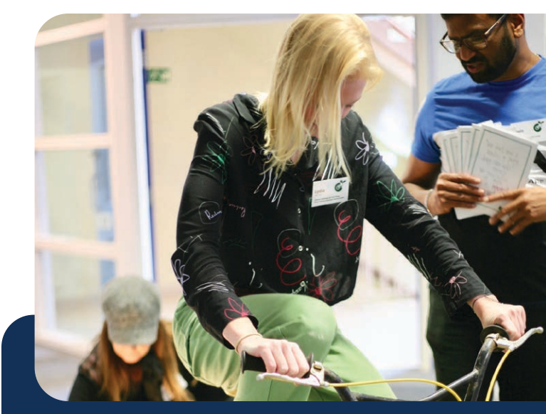
Figure 3: All 1 Collective and Lab workshop