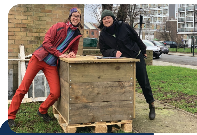
Figure 6 –Incredible Edible Lambeth community composters with one of the newly installed Incredible Edible Lambeth compost bins

The objective is to set up community composting facilities on 25 housing estates in Lambeth, where the council does not currently offer a food waste collection service. The intention is that this will generate free compost which can be used on community gardens. The project is recruiting local 'compost monitors' who will be supported to set up the bins, with tools, material and training being provided - including 'non-violent communication' training to support those involved with managing any conflicts that might arise within their group. Participants are also invited to monthly workshops on topics related to composting.