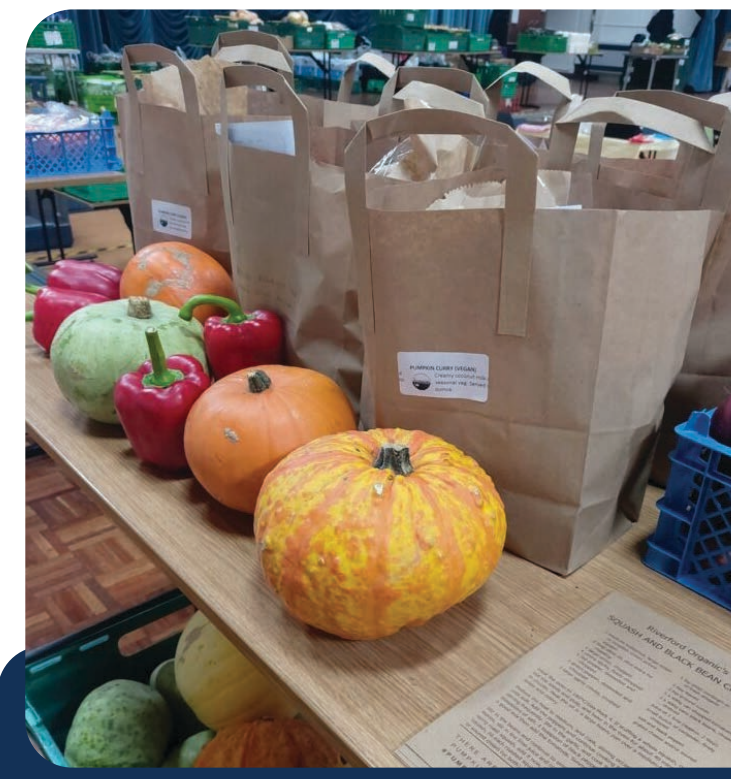
Figure 5 - Waste Innovation Station Headquarters, surplus food ready to be distributed.

Surplus distribution has to be as easy as possible for the stores. Cherwell Collective has a waste carrier licence,