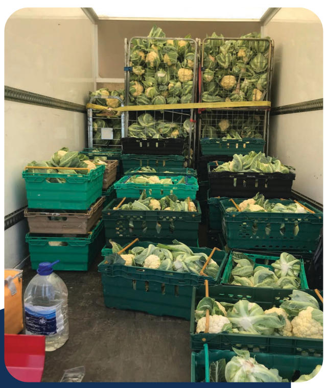
Figure 8 - Closing Loops, a lorry-load of gleaned cauliflowers