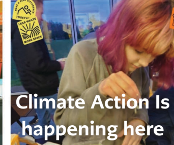
Figure 3 - Food Use Places engagement messages