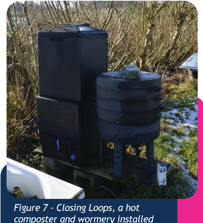
composter and wormery installed at one of the sites

mean that the council will need to bring in weekly food collections by the end of 2025. Closing Loops are considering how they can best respond to this change with ways to celebrate and raise awareness of local closed loops of food waste and all the benefits of community composting for communities and ecosystems, in contrast to food waste being transported away to a big anaerobic digestion facility. They are also looking at opportunities for developing initiatives that will not be impacted by the regulations- which only focus on household food waste. This includes doing a feasibility study to test the potential for small business composting within the district in response to interest from local cafes and restaurants.