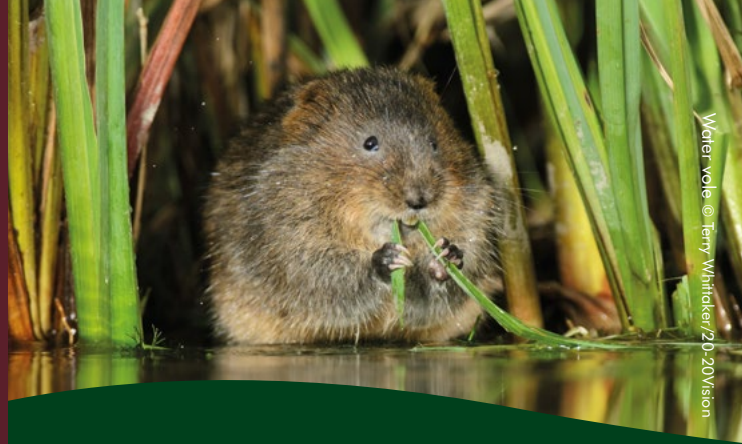
Water vole

Filtered by the chalk of the South Downs, the crystal clear waters of the River Meon flow for 21 miles down to the Solent. At South Farm you'll see one of the sources of this beautiful river known as 'the Swift one'. Providing a rare and precious habitat for an array of species, you might be lucky enough to spot otter and kingfisher. The river supports a good population of fish too such as wild trout, minnows and brook lamprey.