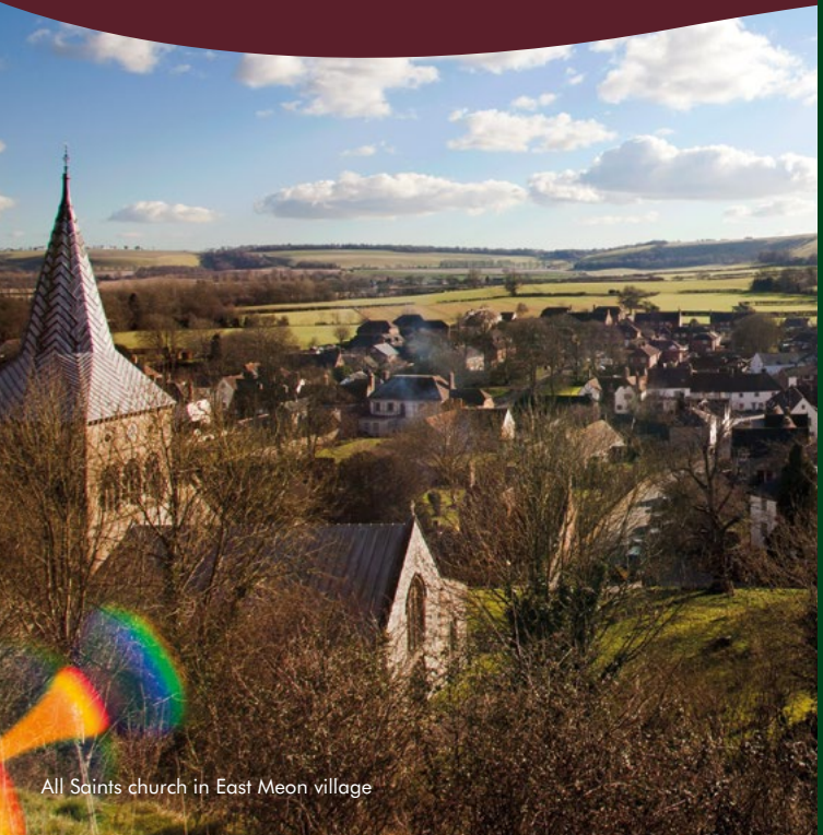
All Saints church in East Meon village