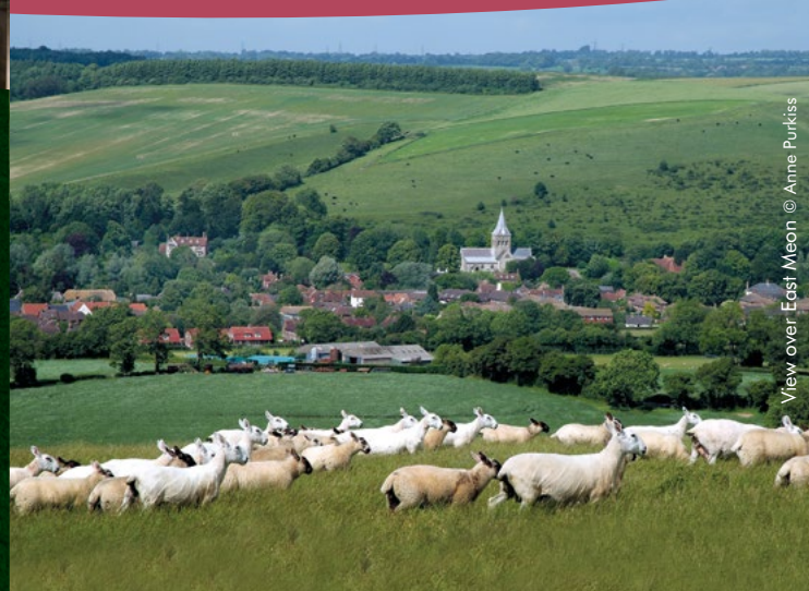
View over East Meon

Head at Eastbourne. The section of this trail in these walks gives you stunning views out over the quintessential English, rolling countryside.