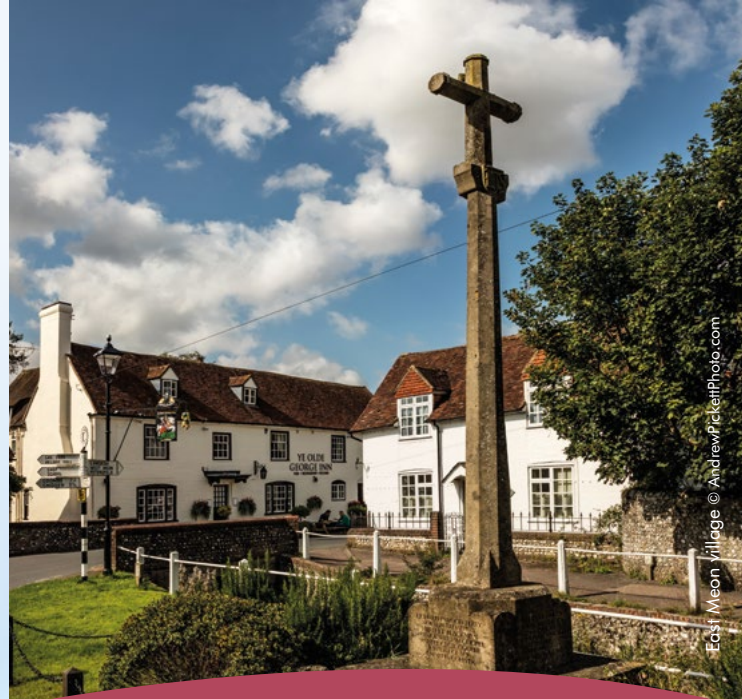
East Meon Village