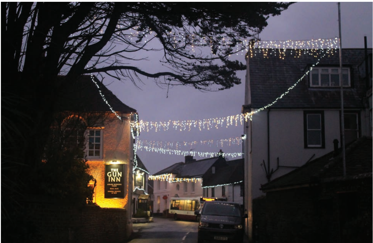
Christmas 2015 - 'Light up The Square' community initiative