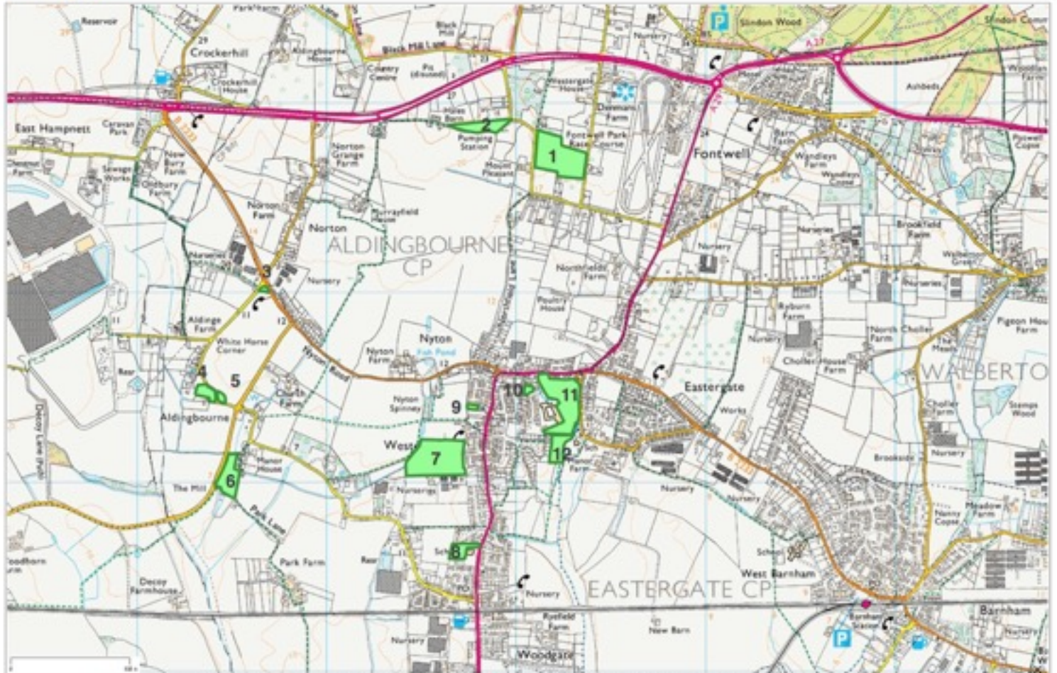
Date Created: 15-5-2015 | Map Centre (Easting/Northing): 494063 / 105749 | Scale: 1:20021