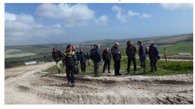
Site visit to South Downs Way at Annington piggery