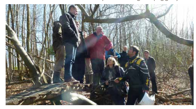
Site visit to mountain biking track at Steyning

SDLAF who offered detailed advice on access and commended Sussex Wildlife Trust on its consultation process.