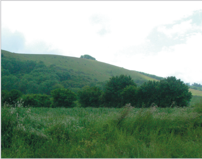
A terrace formed from Upper Greensand with a locally prominent northern wooded escarpment.