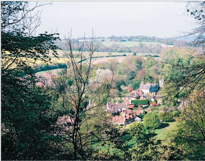
View of Selborne from the hangers.