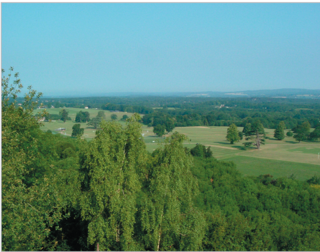
View of Lavington Park landscape, surrounded by more dense woodland, from Duncton Hill viewpoint.