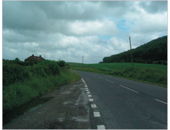
A low settlement density.