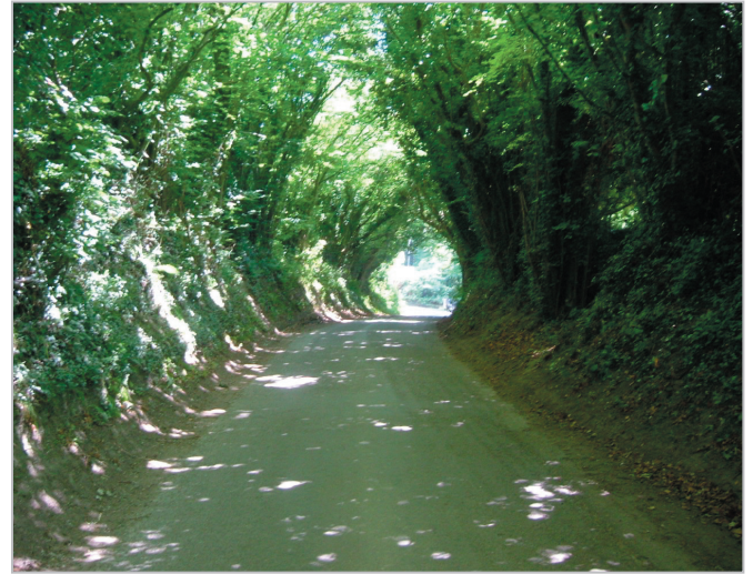
Sunken lanes in the sandstone.