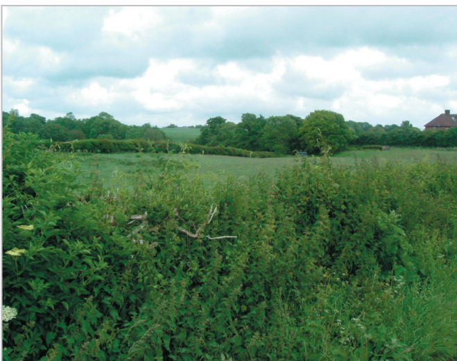
Occasional hedgerow and woodland blocks provide important ecological habitats.