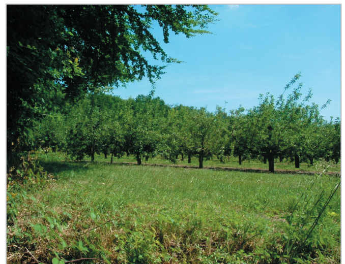
Orchards around Selborne.