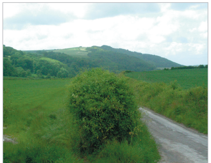
Narrow, sunken lanes cut through the landscape.