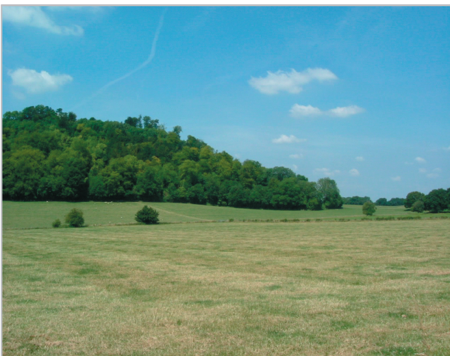
A terrace formed from upper greensand with a locally prominent wooded escarpment forming the eastern edge.