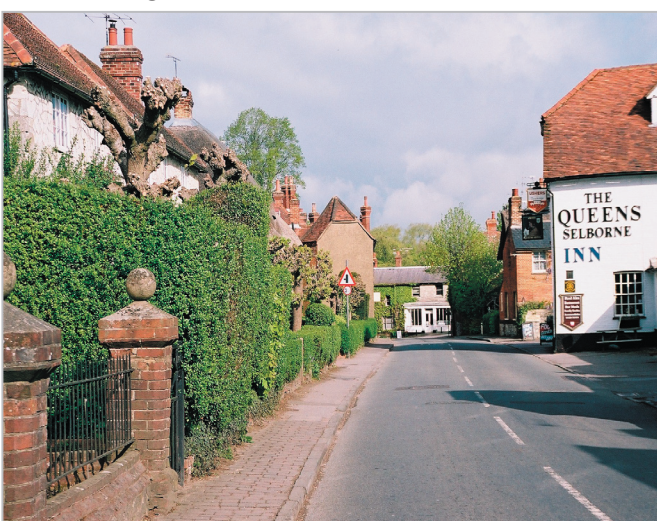
Selborne High Street.