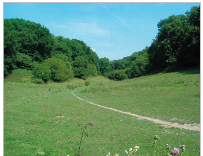
Hanging woodland associated with steeper slopes is a habitat of international importance.