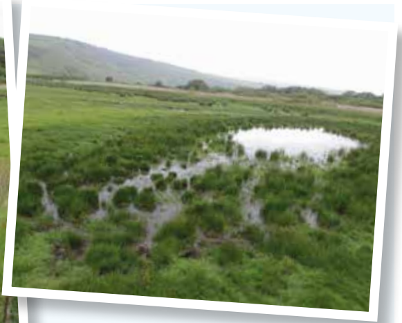
Left: Cuckmere river on the left and Charleston reed fen to the right.