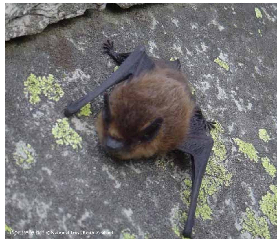
Pipistrelle bat