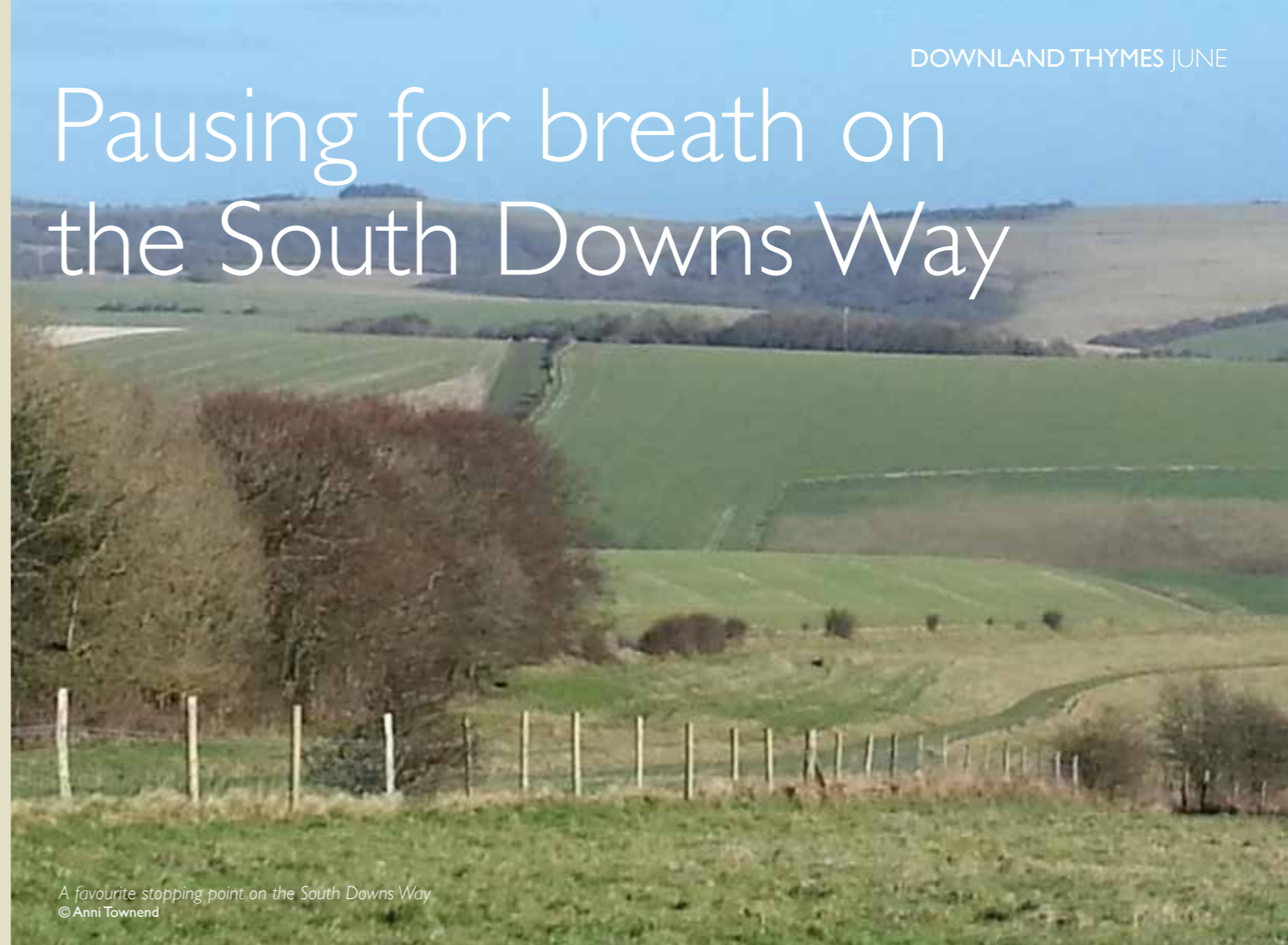
A favourite stopping point on the South Downs Way

As regular readers of Downland Thymes , or those of you who listened to Ramblings on Radio 4 last October, will know I love the South Downs and feel especially privileged to live here on the South Downs Way not far from Lewes.