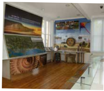
Public information area in the new South Downs Centre